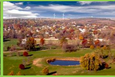
Rock Port, MO