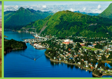
Kodiak Island, AK