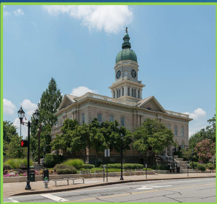
Citizens of ACC